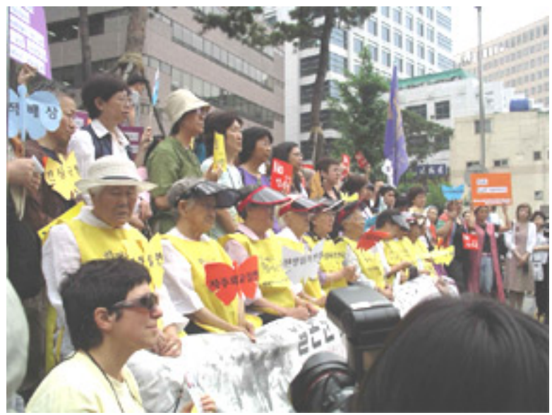
Former comfort women in 2005 demonstration in Seoul

The statement came just hours after South Korean President Roh Moo-hyun marked a national holiday honoring the anniversary of a 1919 uprising against Japanese colonial rule by urging Tokyo to come clean about its past.