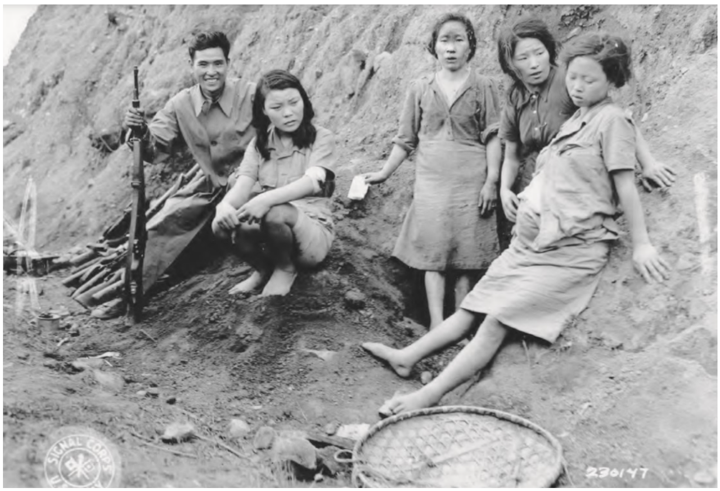
Citation: Digital Museum-The comfort women issue and the Asian Women's Fund: Korean Comfort Women who survived and were protected in Lameng, Yunnan, September 3, 1945.